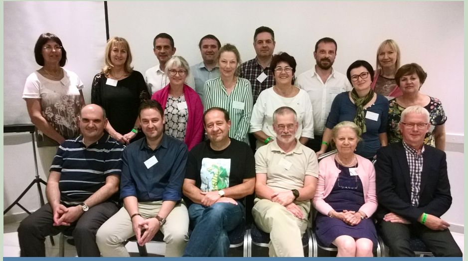
Happy participants and the Faculty of the Leonardo 3 course

The first Level 3 course was held in Portugal between December 2011 and June 2012. The second Level 3 course to be organised by EURACT has now kicked off, and the first part was held on the 14th October in Malta. The second part will be held in Thessaloniki,