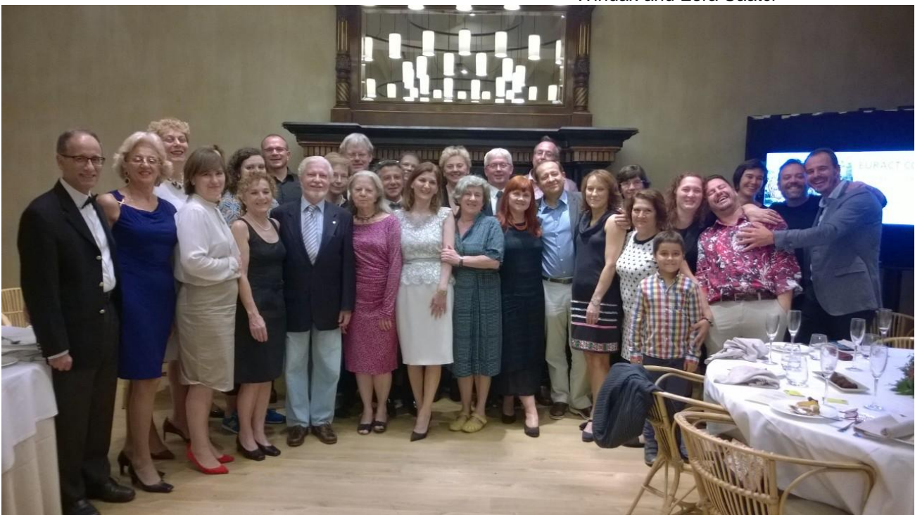
The EURACT Council and guests