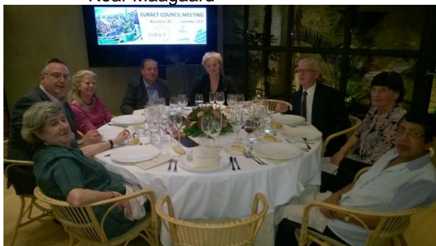
Guests at table 1