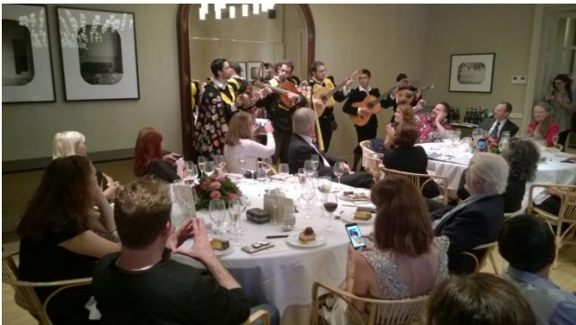
Local medical students entertaining the guests