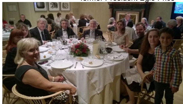
Guests at table 2