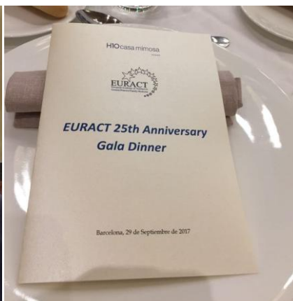
Welcome to the EURACT 25 th Anniversary Gala Dinner!